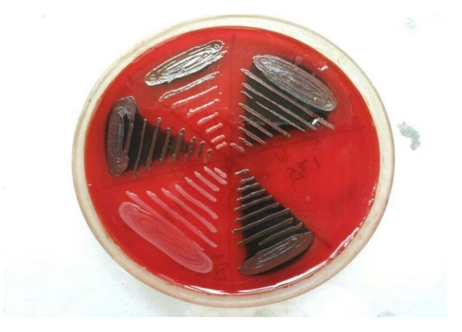
Figure.1 Congo Red Agar Plate with Biofilm Producing and Non-Biofilm Producing Strains